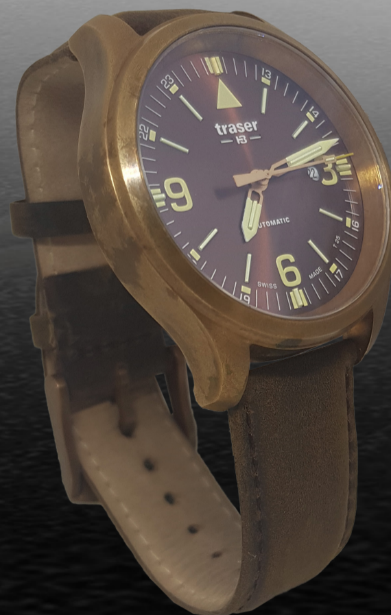
Patina on the watch case